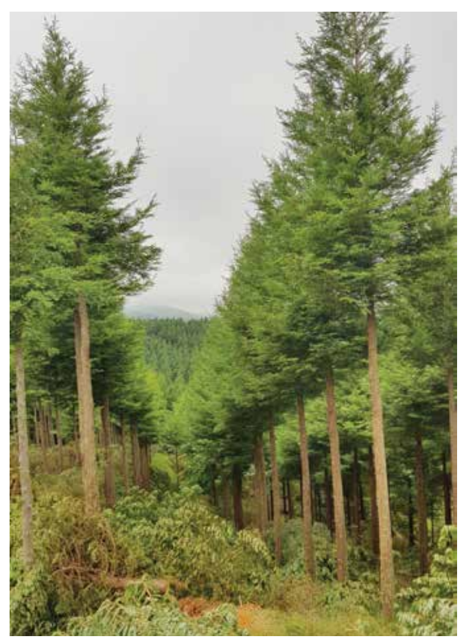
Tended New Zealand redwoods

All this from a forester managing a community forest with a number of stakeholders with varying objectives, needing to meet federal and state regulations as well as following Forest Stewardship Council (FSC) guidelines. The range of issues a redwood forester faces every day made my head spin – hitting budgets, maximising TRV and improving percentage recovery of higher value logs seemed to be quite far down the list of things to do.