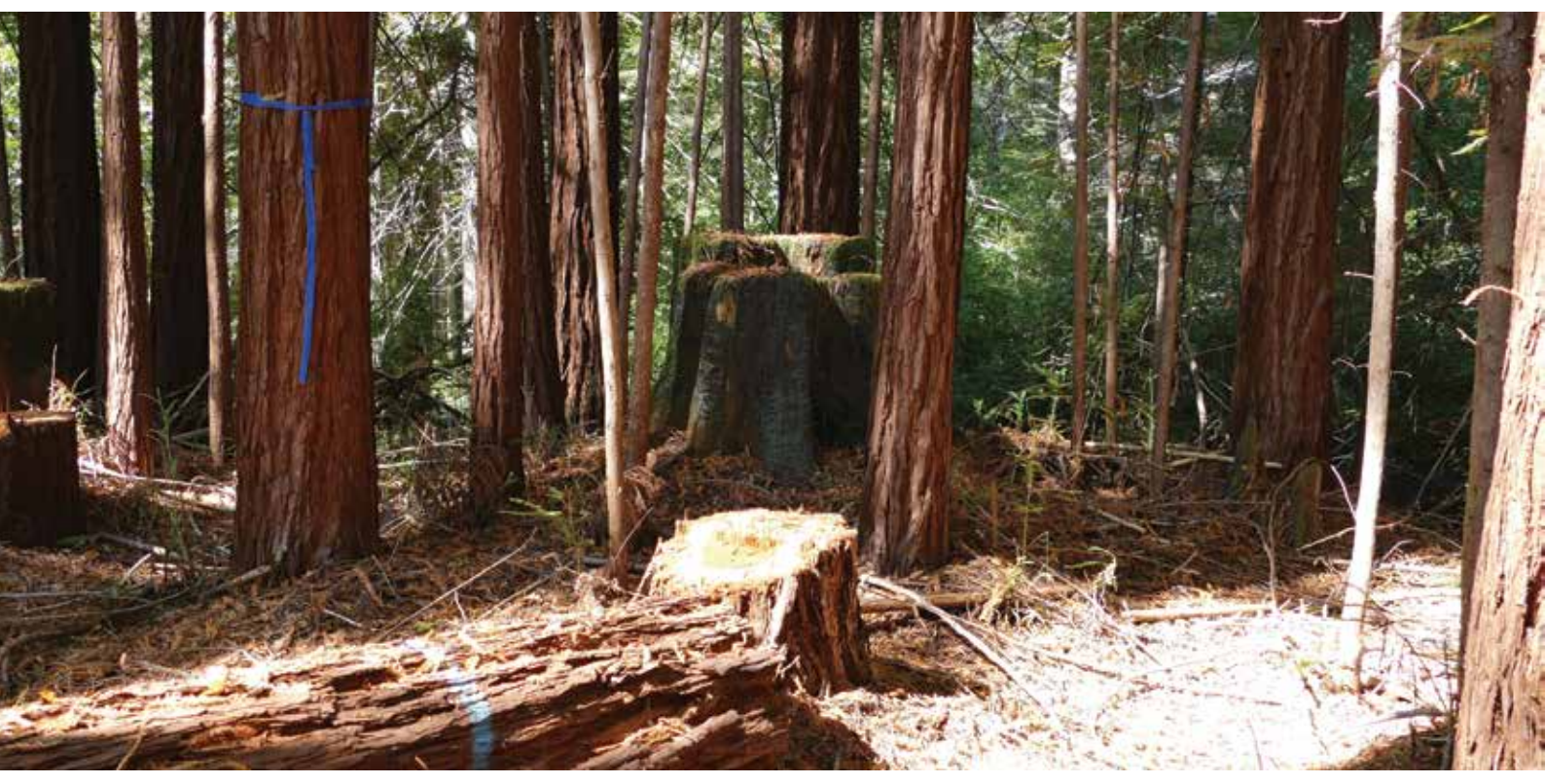
Redwood harvest in US