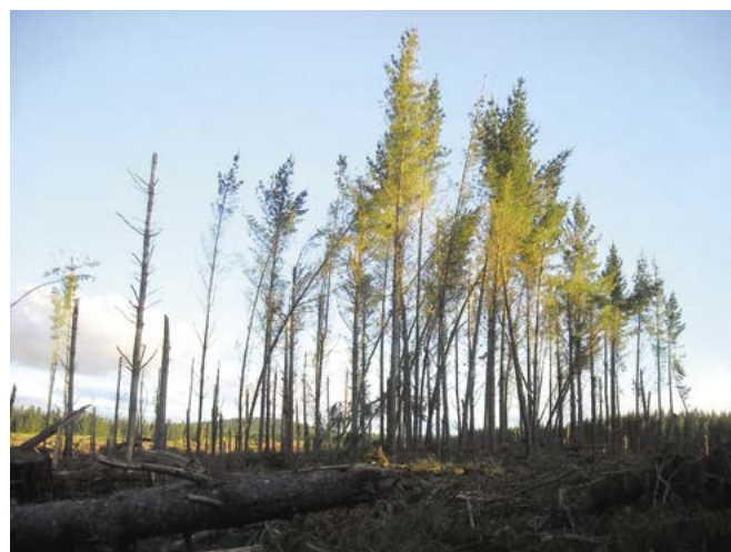
After-effects of a storm in a central North Island pine plantation, May 2011

Storms in Pinus radiata plantations are unpredictable and costly (Moore et al., 2013). Apart from the direct damage they cause, additional losses follow as sapstain and other forms of degrade develop before all the sound timber can be recovered. A means of anticipating when sapstain will appear would greatly assist forest managers overseeing salvage operations after windthrow has occurred.