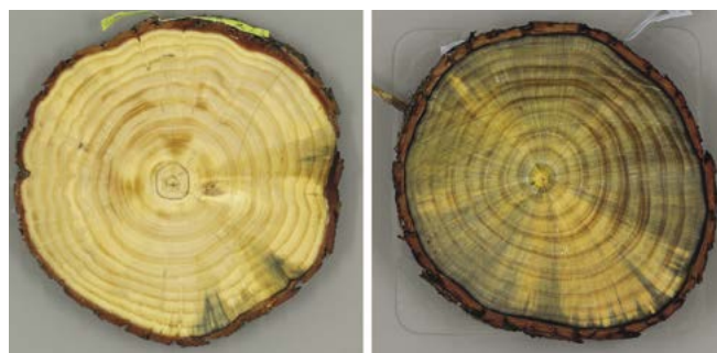
Sapstain in radiata pine discs cut during the second study showing 13 per cent (left) and 100 per cent (right) of the cross-sectional area affected. Brown staining associated with colonisation by decay fungi is also treated as sapstain

The second of these studies was conducted at six locations distributed throughout the country. At each location, trees were felled and left on the forest floor to simulate windthrow. Felling was undertaken in summer and winter at all locations and also in spring and autumn at one selected location. Trees were assessed periodically after felling by cutting discs along each stem, and over 2,000 discs were taken from more than 450 trees. Samples were weighed and dried to evaluate moisture content and the discs were scanned to determine the percentage cross-sectional area affected by sapstain.