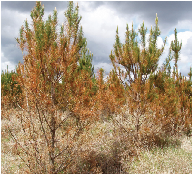
Figure 1. Young radiata pine trees showing high Dothistroma needle blight severity.

determined across the unsprayed remainder of the plantation estate. The total area used in this calculation was reduced to ensure that the effect of disease severity was only limited to stands that were \leq 15 years. The national exotic forest description (MAF, 2010) was used to determine the proportion of the estate with age classes \leq 15 years.