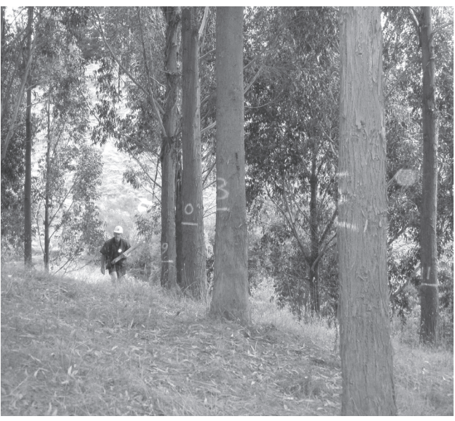
Figure 1: 13 year old Eucalyptus fastigata, Manawatu

Sequoia sempervirens is considered to be a relatively pest resistant tree species, with no major insect or disease problems in New Zealand or overseas (Bain and Nicholas, 2009; Gilman and Watson, 1994; Sinclair and Lyon, 2005). New Zealand disease records show there are a limited number of pathogens recorded on S. sempervirens and all are secondary or inconsequential (Ganley and Berndt, 2009). A few insects have been recorded damaging S. sempervirens in New Zealand, however these are not significant problems (Ganley and Berndt, 2009).