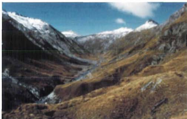
Upper Snowy Creek as seen from Rees Saddle (1470m) (Richard Thum).

In what is becoming a serious habit for a few Southern members of the local section, a well-known location was chosen for this year's NZIF Study Trip – the Rees and Dart valleys. This was the second visit by local section members to these popular valleys (and the author's fifth!). The Otago/Southland section of the Institute is fast approaching the dilemma of finding new accessible areas to venture into within the southern part of the South Island.