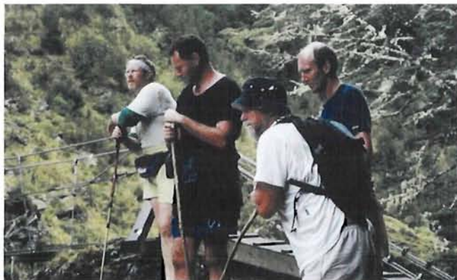
Spotting imaginary trout in the Dart River.

And what about 2003? The local section is looking at revisiting the Young, Siberia and Wilkin valleys, which are in the Wanaka catchment. Details will be out soon.