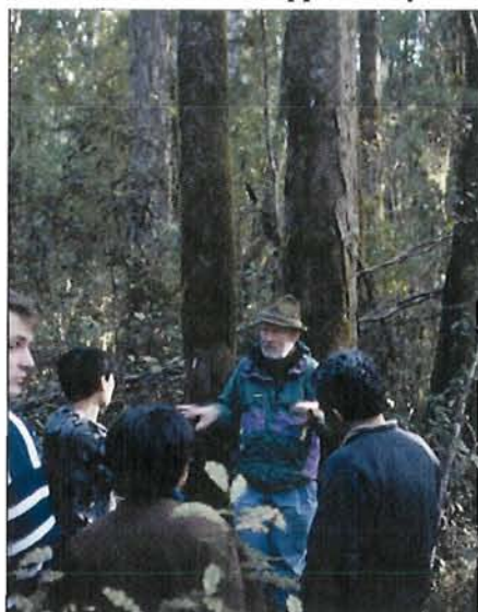
Are these forests just for viewing?

There is little doubt that the RMA process would have created the best opportunity for the merits/demerits