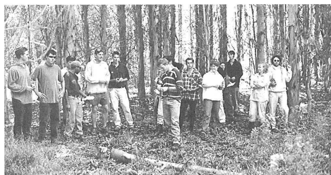
Students on a mensuration exercise in the Lincoln University eucalypt block.