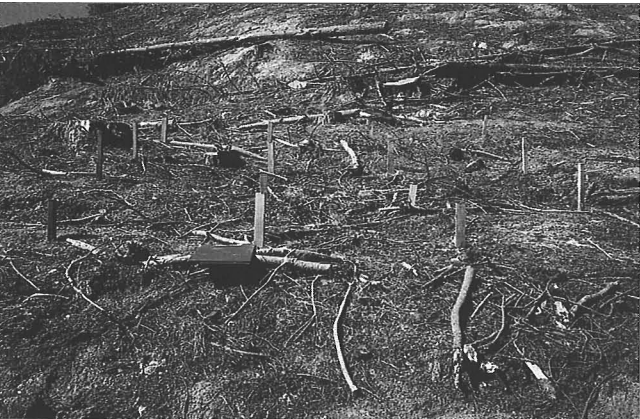
Figure 2: An example of vegetation recovery on a partially-disturbed plot. The view above was taken immediately following clearfelling of 30-year-old Pinus radiata by haulers. The view below is the same plot two years after clearfelling. The dominant early colonisers of the plot were sweet vernal ( Anthoxanthum odoratum ), sorrel ( Rumex acetosella ), scotch thistle ( Cirsium vulgare ) and Yorkshire fog.