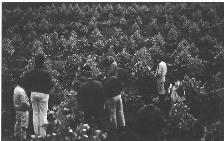
Members of the Management of Eucalypts Cooperative examining a one-year-old E. nitens stand in Kinleith Forest.

The cooperative research programme is developed with input for its nine technical members who have created a programme relevant to the management of eucalypts. The siting project is expected to give information of immediate use to