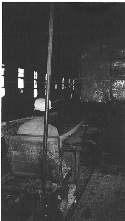
Huatai wood processing factory, Beijing.

If New Zealand is to gain the best possible price for our exports it is important that the Chinese are able to use it in the highest possible value applications. Diminishing supplies from traditional sources