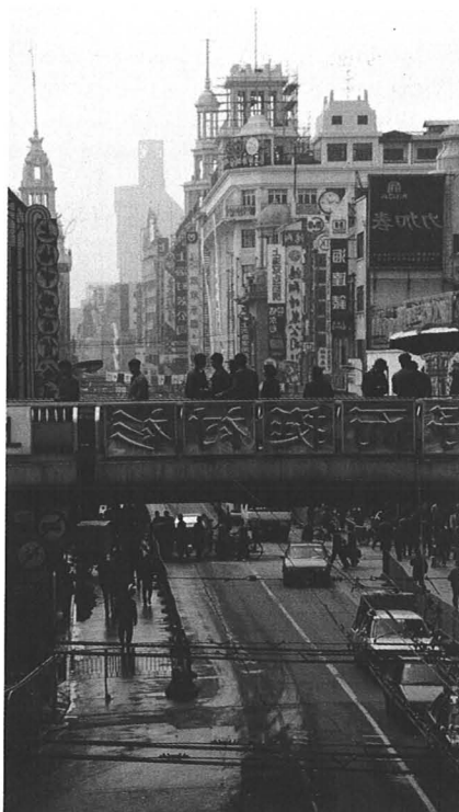
Nanjing Road, the main commercial street in Shanghai.

One New Zealand company is attempting to promote radiata pine by considering a joint venture with a Chinese corporation. The joint venture will aim mostly at transferring technology to maximise the value