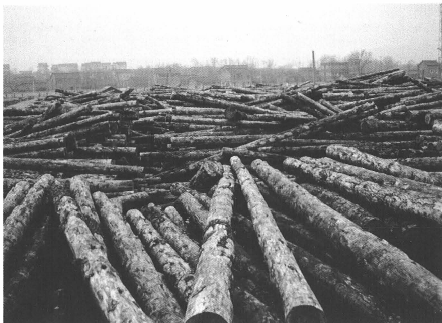
New Zealand radiata pine logs at Zhenching Port.