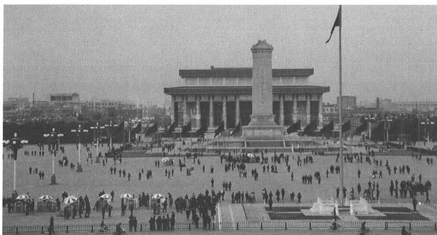
Tiananmen Square, Beijing.

All Chinese seem extremely enthusiastic about the idea of joint ventures with foreign partners. Usually, after exchange-