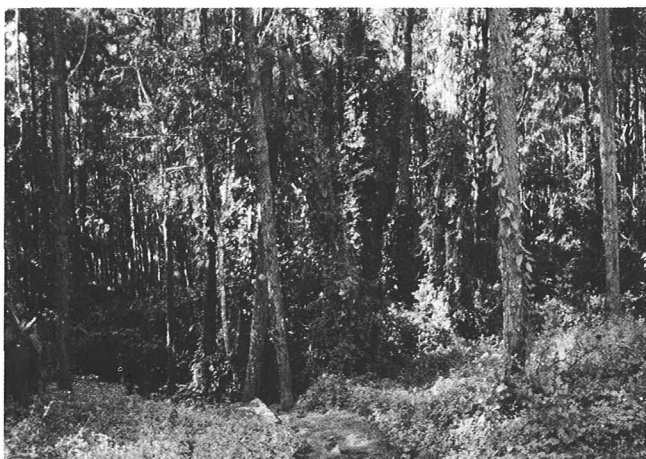
Untended Pinus patula stand, Viphya Forest Plantations, Malawi.

A further test of the robustness of the FRI inventory systems came with an invitation from the United Nations' Food and Agriculture Organisation to provide a resource monitoring system and examine management options for Viphya Forest, Malawi, Central Africa. This 54,000 hectare forest was planted on rolling high-altitude grassland between 1950 and 1982. It comprises mainly Pinus patula , but also has a substantial component of P. elliottii and P. kesiya , grown for pulpwood. Most of the stands were unthinned, and many were 100% pruned to 1.8 m for access. A significant proportion, however, had been managed on a thinning and pruning regime traditionally used by the Malawi Department of Forestry.