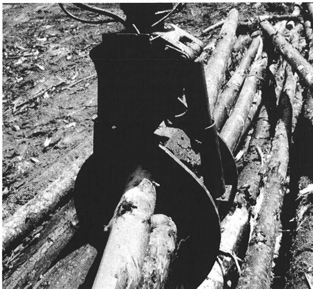
Prototype loadcell on knuckleboom loader

New Zealand's annual cut and roundwood measurement is due to rapidly increase. The understanding of roundwood measurement and standard of scaling has improved to the point where procedures are documented and reasonably uniform over the whole country. However, there are sawmillers who dispute measurements and procedures in an attempt to negotiate a price reduction on log purchases. New Zealand could benefit from fur-