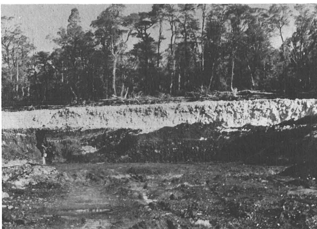
About five metres of gravels overlies coal measures in beech forest at Giles Creek.

Under the NZIF constitution, any members of the Institute may send objections in writing to the Registrar of Consultants, NZ Institute of Forestry, PO Box 19840, Christchurch.