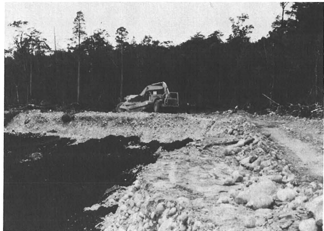
Stripped soil being loaded for transport at the Giles Creek coal mine.

burden that the miners must strip consists of coal measures, rocks that have markedly different physical and chemical properties from the mainly granite-derived gravels. Therefore there are additional research opportunities for monitoring growth and performance of indigenous species on these different materials. The beech forest differs somewhat between the floodplain and the low outwash terraces because of natural fertility differences. More red beech trees occur on the floodplain; red, hard and silver beech occur on the terraces, with scattered podocarps. The main podocarp component (rimu) was removed by selective logging in the 1980s, but with minimal canopy disturbance for the most part. Regeneration has been vigorous in the gaps that were created. The area is currently designated as part of a wildlife corridor by DOC.