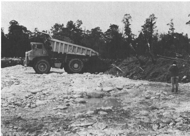
Mixed stripped soil materials being dumped on compacted gravels at Giles Creek coal-mining site.