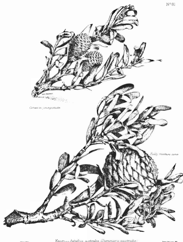
A drawing from Kirk's 'Forest Flora of New Zealand'.

In 1875, the year before Campbell-Walker arrived, Kirk reported on the durability of New Zealand timbers in a substantial publication of the Government Printer (Kirk, 1875). It