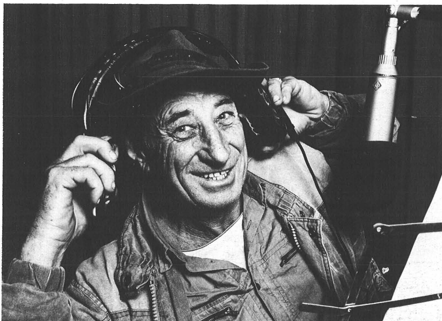
Well known for his love of the outdoors, Barry Crump was only too happy to be the voice behind this summer's Fire Prevention Campaign being run by the New Zealand Forest Owners' Association.

"A lot of forest fires are caused by people who just don't think," he said.