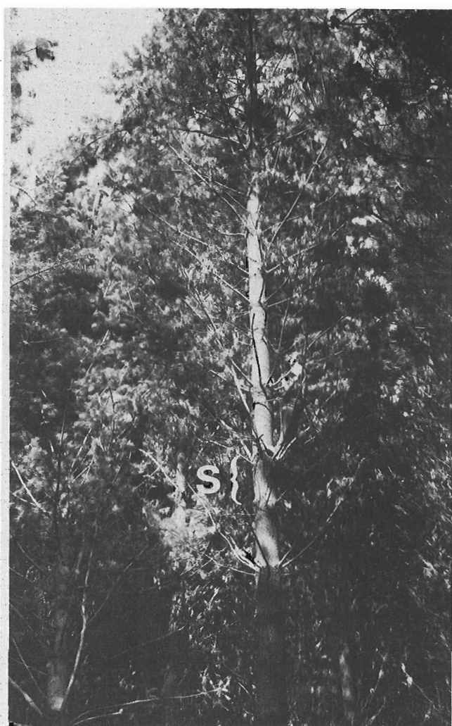
Fig. 1 — Long and short internode radiata pine (BW 19166/67 Hemming) L = a 2.2m internode (of clearwood) on a typical long-internode tree S = a 0.5m internode on a typical short-internode tree

programme. The best of the progeny-tested trees are artificially mated with one another to generate a progressively improved breeding population. From predictions based on quantitative genetic theory, this 'recombination' and selection step is expected not only to accumulate favourable genes from both parents but also to increase the frequencies of such genes further by selecting the very best of the offspring. The improved population becomes the basis for a further round of plus-tree selection and progeny testing, in a method known to breeders as "recurrent selection". Second-generation selections have only recently been used in seed orchards, giving some idea of the long time periods involved in both the reproductive cycle of the species and in adequate evaluation of candidate trees in progeny tests. Although it will be 2030 and beyond before the offspring of most second-generation trees find their way into the New Zealand wood-using industry, the decisions regarding their genetic makeup must be made today.