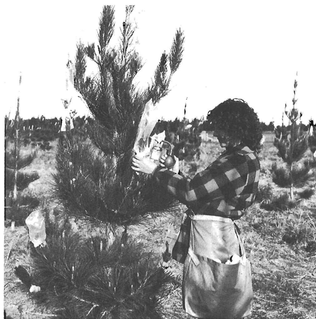
Fig. 3 Controlled pollination at Amberley seed orchard to produce large quantities of seed of known parentage.

Recently we have started to explore the second alternative, which is to place selection emphasis on just one 'special-purpose' trait, while accepting limited gain in other selection criteria. Although we can probably afford to retain more than one special-purpose breed, it must be clear that the more options we pursue, the greater is the cost of resources expended. Large gains in internode length are expected from progeny of a seed orchard of long internode clones. We are currently well placed to advance a special-purpose breed for increased wood density, and we are also about to plant an orchard of clones with improved resistance to the needle blight Dothistroma pini .