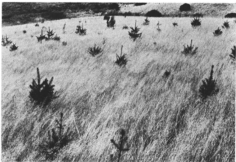
Plate 3.—Berwick trials, subplot 2A., Control, untreated 2/0 Milton Douglas fir photographed 3 years after establishment. Note variation in height growth and numerous blanks. The small trees are chlorotic. Mean height 2.0 ft., more than \frac{3}{4} are under 2 ft. 6 inch. Survival 68%.