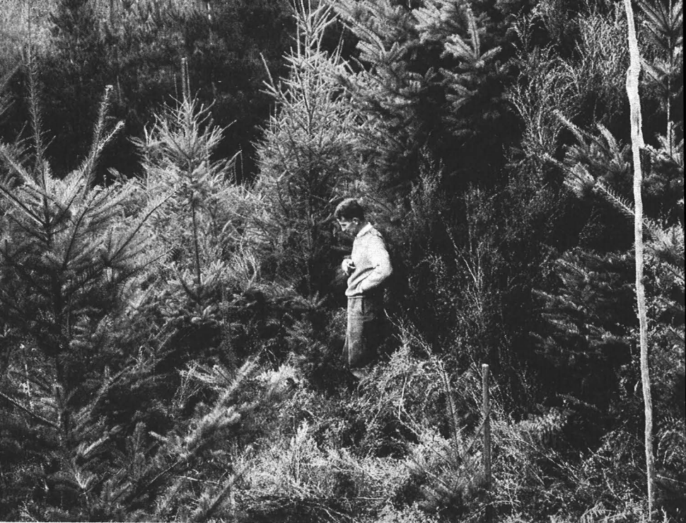
Plate 1.—Douglas fir, Compt. 31, Berwick Forest, nine years old. Note variation in tree height (3-20 ft) and open habit of large trees. The smaller trees had been chlorotic and in check for seven years but recovered their green colour during the winter, 1956, and as can be seen are now growing vigorously.

uniformly green, sturdy plants, averaging about 1 foot 3 inches in height in two years, with very extensive fibrous rooting systems.