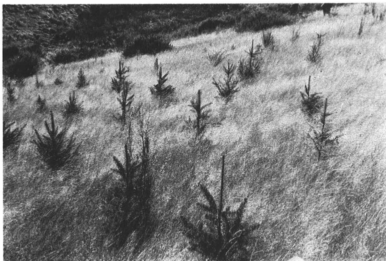
Plate 6.—Berwick trials, subplot 2D., 2/0 Milton Douglas fir treated by puddling in a clay and duff puddle. Mean height 2 ft. 11 inches. About \frac{2}{3} are between 2 ft. 7 inches and 5 ft. 6 inches. Survival 95%.