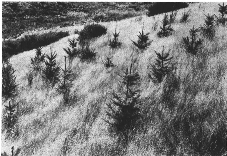
Plate 4.—Berwick trials, subplot 2B., Untreated 2/1 Tapanui Douglas fir photographed 3 years after establishment. Mean height 3 ft. 10 inches, nearly \frac{2}{3} are between 3 ft. 7 inch and 6 ft. 6 inches. Survival 98%.