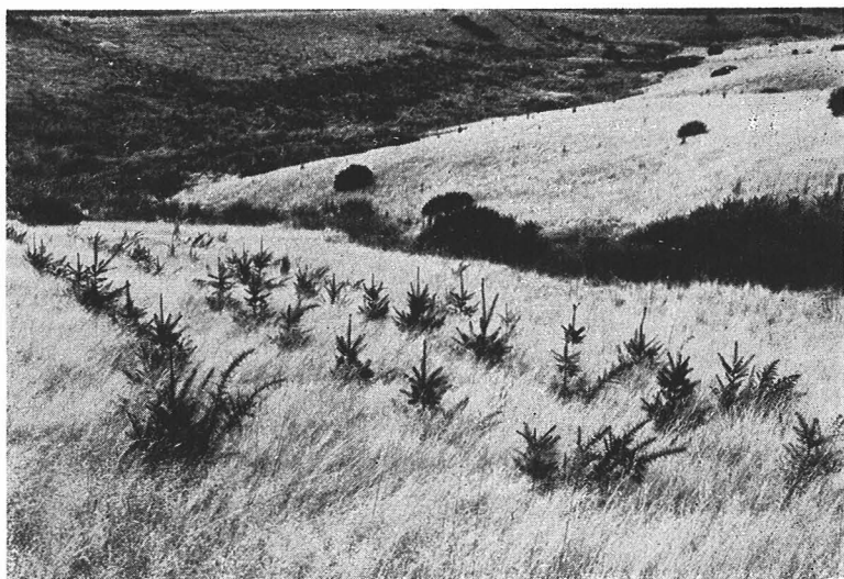
Plate 5.—Berwick trials, subplot 2C., 2/0 Milton Douglas fir treated with a handful of duff in the planting hole, photographed 3 years after establishment. Mean height 2 ft. 10 inches; over half the trees are between 2 ft. 7 inches and 5 ft. 6 inches. Survival 98%.