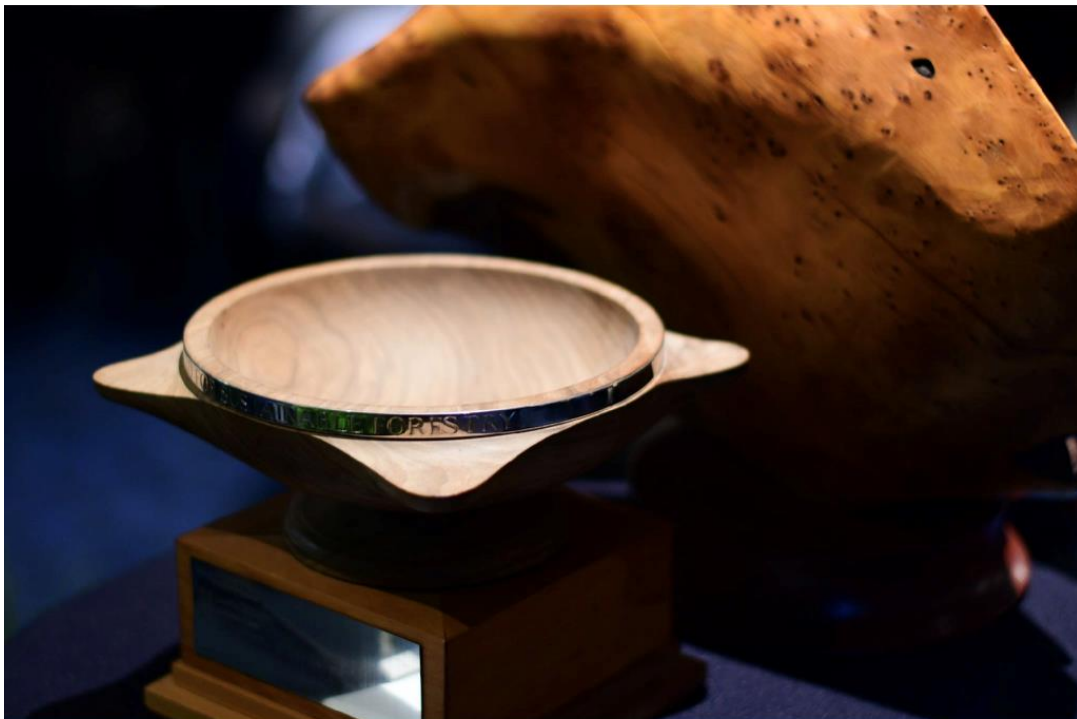
Prince of Wales Sustainability Cup