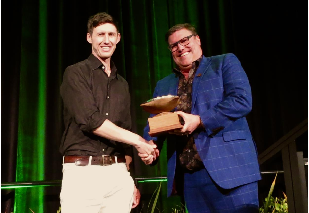
Prince of Wales Sustainability Cup Awardee: Chris Ensor

New Zealand Institute of Forestry - Te Pūtahi Ngāherehere o Aotearoa Incorporated -