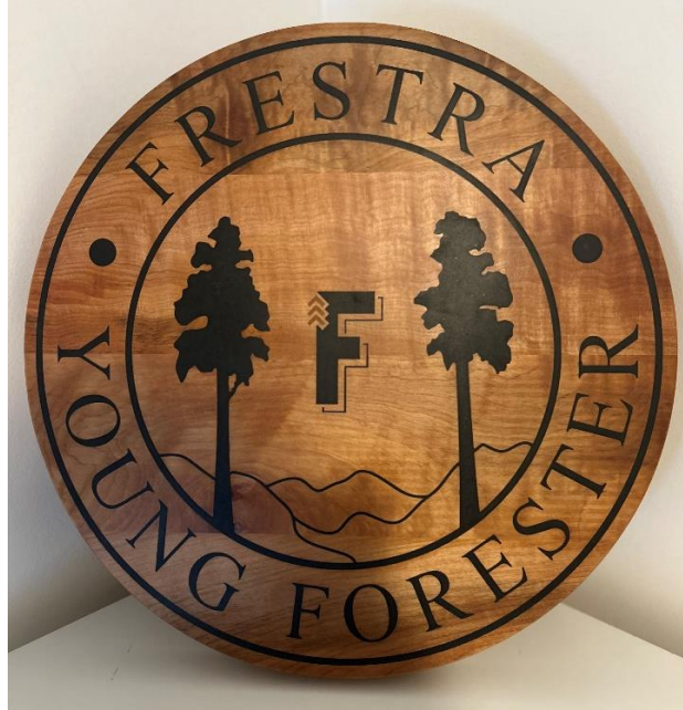
FRESTRA Young Forester of the Year award