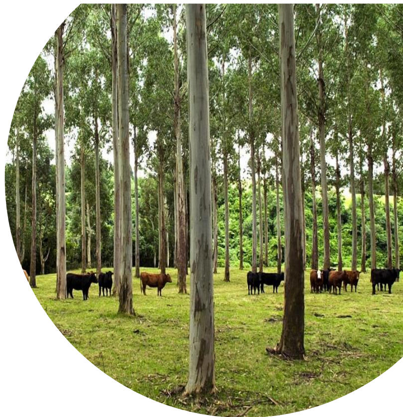
Photo: NZ land-use & cattle under Australian Eucalypts