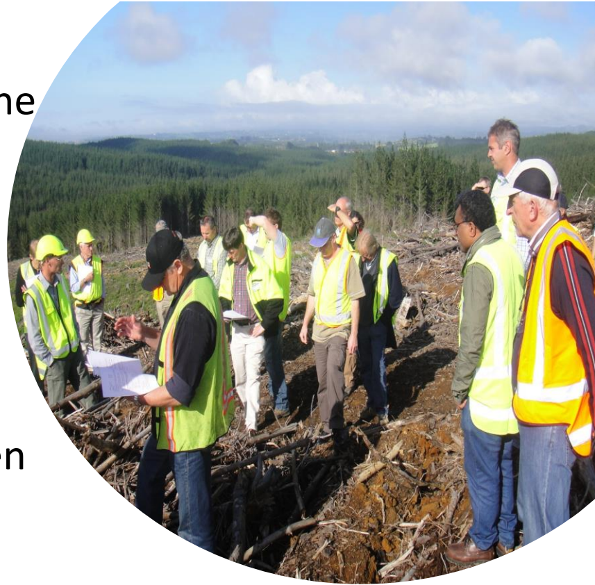
Photo: ANZIF May 2011, Riverhead Forest Field Trip, NZ