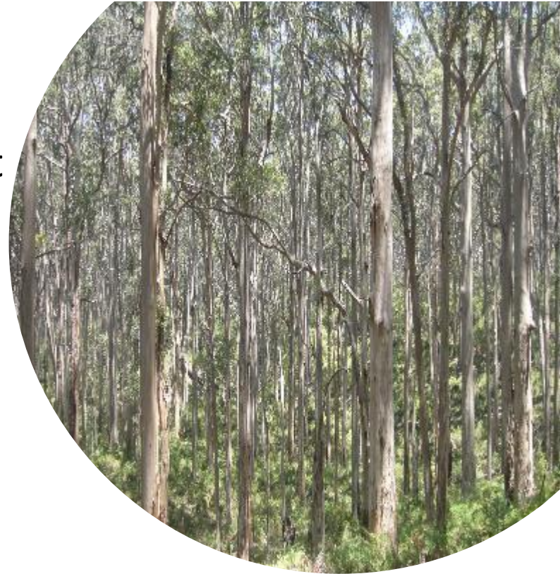
Photo: Karri & Jarrah forests, south-west, WA Australia 2009